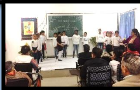
Dance & song performance