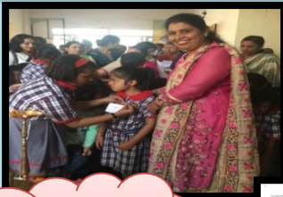
Tiny tots welcome

An orientation program was organised by our Vidyalaya to welcome tiny tots of class 1 students. By this program our Vidyalaya have done a small effort to make parents and students familiar with KVS norms and school environment.