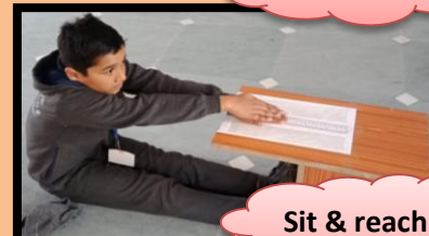
Sit & reach