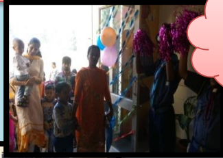
Welcome of the guests