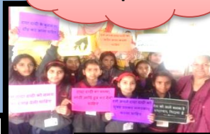
Greetings for Grandparents