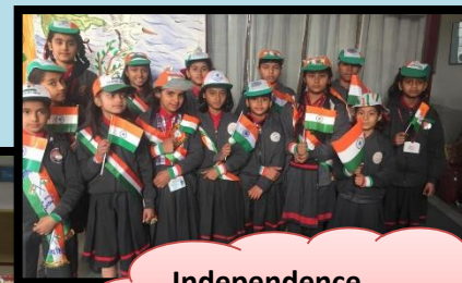
Independence day celebration